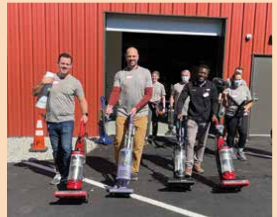
DPS Group volunteers ready their vacuums.

Groups from businesses large and small, schools, and community organizations are an important part of our volunteer effort. In 2022, 49 groups took on special projects and helped with the constant effort required to collect, process, and distribute nearly 70,000 household items to those in need.