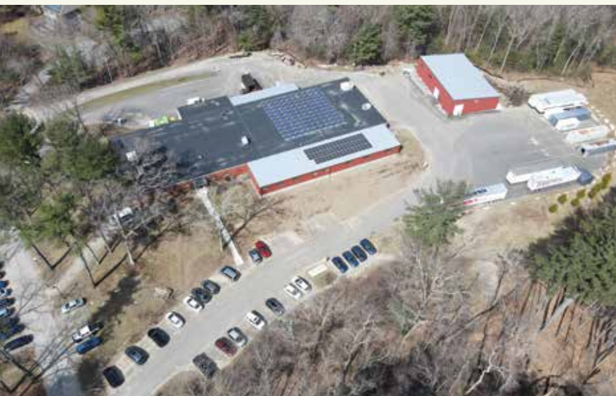
Overview of our expanded campus