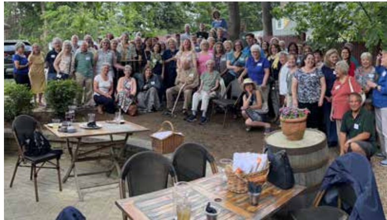
Household Goods volunteers came together to celebrate 30 years of helping people make a home.

Turning empty living spaces into homes for thousands of people would be impossible without this dedicated team. Some volunteers work directly with clients, and it takes many more behind the scenes to ensure every client has access to the quality, variety, and quantity of donated items they need.