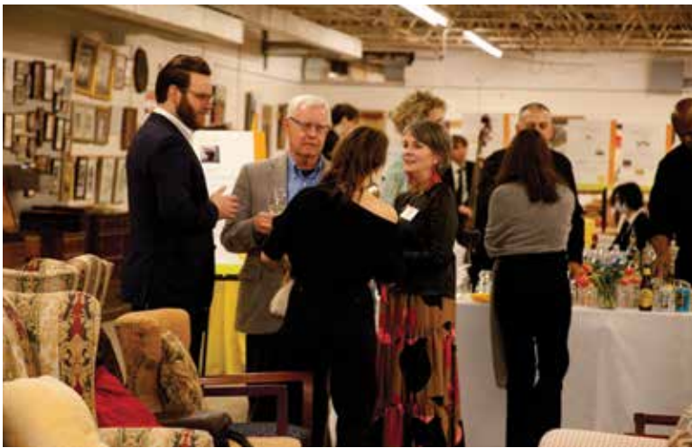
Showroom transformed: a night to remember