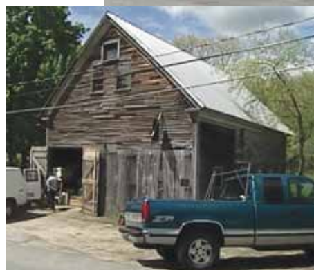
Left: The original Household Goods barn. Above: Our new ‘Barn.’