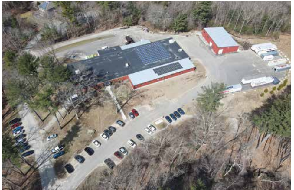
Campus improvements include around-the-building driveway, 4000 sq ft addition (center of photo), new donor drop-off area (upper left), and stand-alone storage building (upper right).

We are humbled and fortified by the community's commitment to our mission, and we hope that this annual report provides you with insight into the impact of your support.