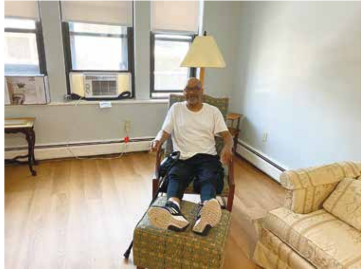
A client from Boston Medical Center rests in his newly furnished apartment.

Household Goods partnered with BMC to pilot the program, and their patients were the first beneficiaries.